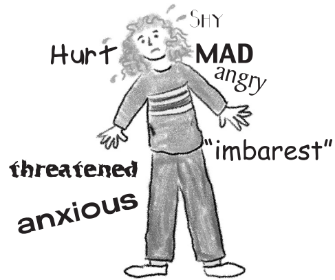
Talking about all those mixed-up feelings is part of the healing that happens at BRIDGES.

Is someone available to visit with our group to tell us more about BRIDGES? A member of our staff will be happy to visit with your group. Call our office, 253.403.1966, to speak with a staff member and schedule an appointment.